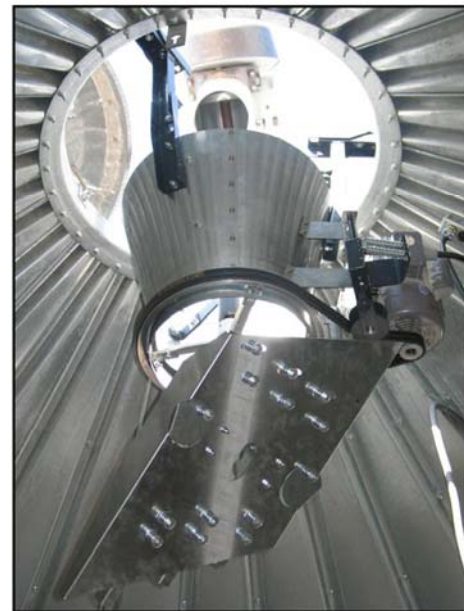
A variety of spreaders available up to 14.6 meter diameter and up to 120 MT/HR capacity.