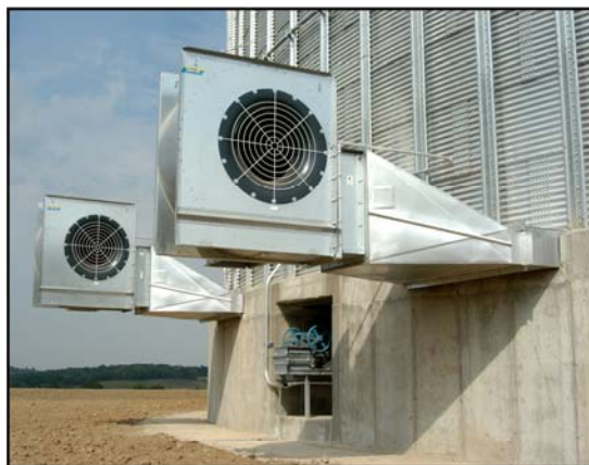
A complete line of aeration products with fans up to 50 horsepower.