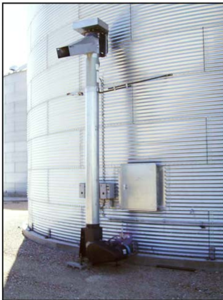
Standard Auger or U-Trough unload systems available up to 150 MT/HR.