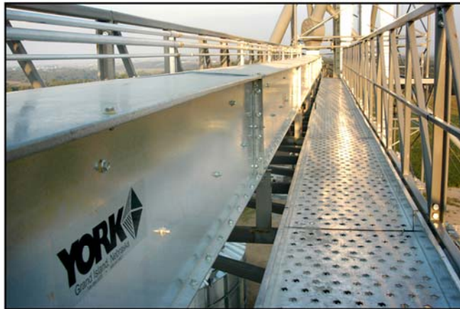
Drag conveyors up to 800 MT/HR capacity.