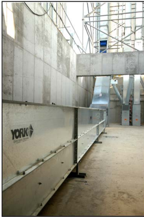
Curved incline drag conveyors for a variety of applications.