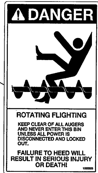
DANGER Sign No. 1002303