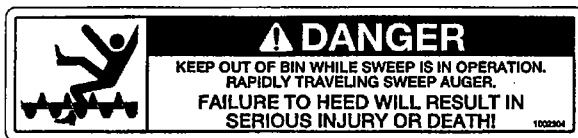
DANGER Sign No. 1002304 1 3/4" x 7 1/2" long